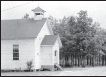
The first church building was completed in 1926.