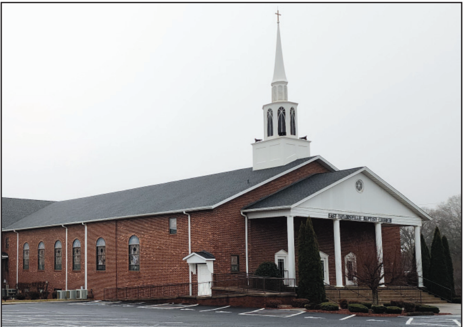
The present sanctuary was completed in 1984.